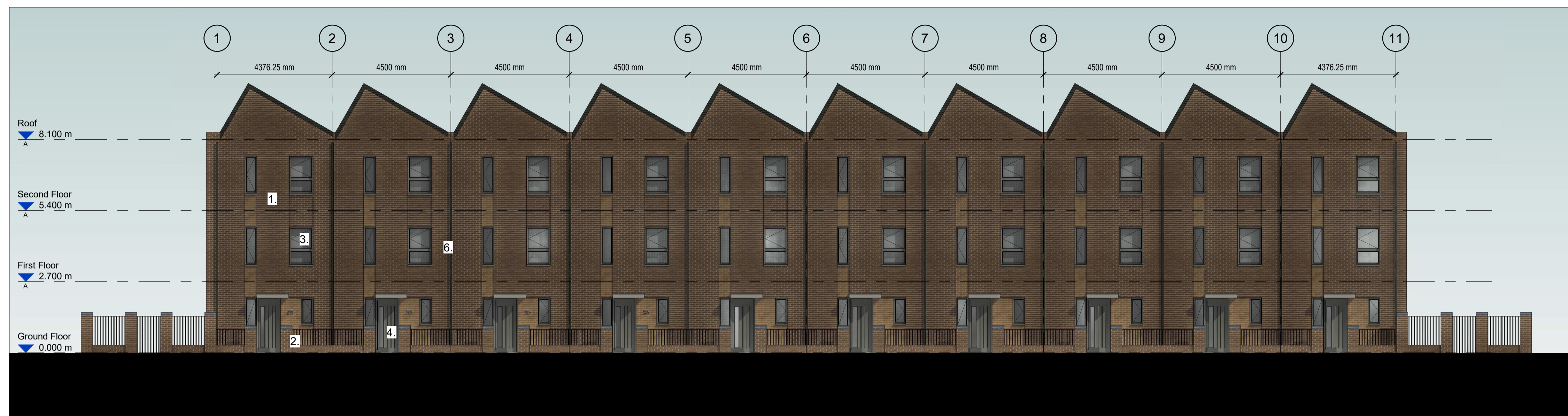
1 SOUTH-WEST 1 : 100