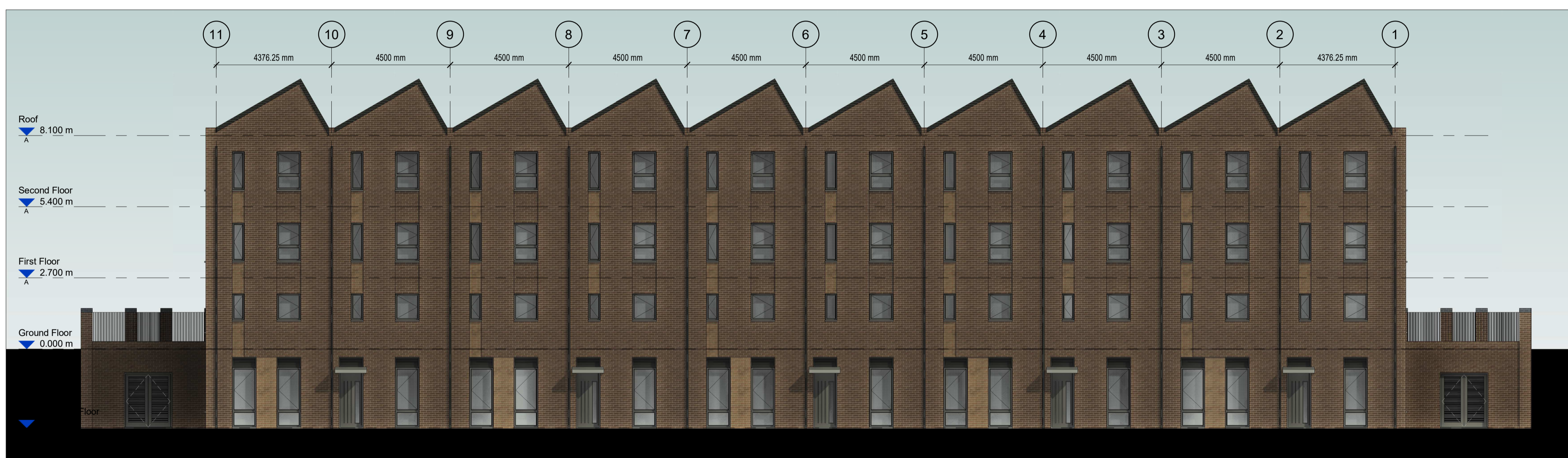
2 NORTH-EAST 1 : 100