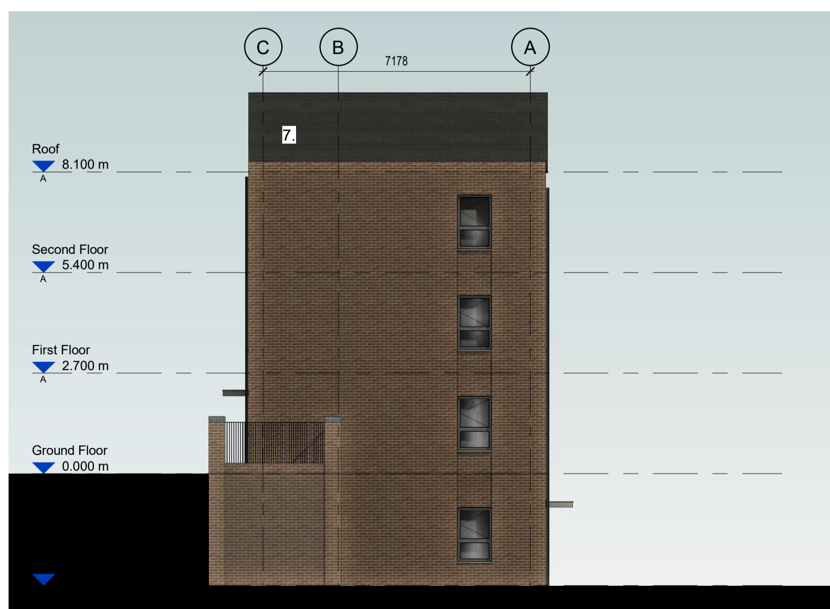
3 SOUTH-EAST 1 : 100